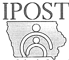
Iowa Physician Orders for Scope of Treatment

As a result of a 4 year successful pilot, IPOST (HF 2165) was signed into law by Governor Terry Branstad on March 7, 2012. This allows the IPOST to be recognized through the state in any setting (home, care facility, hospital, and hospice).